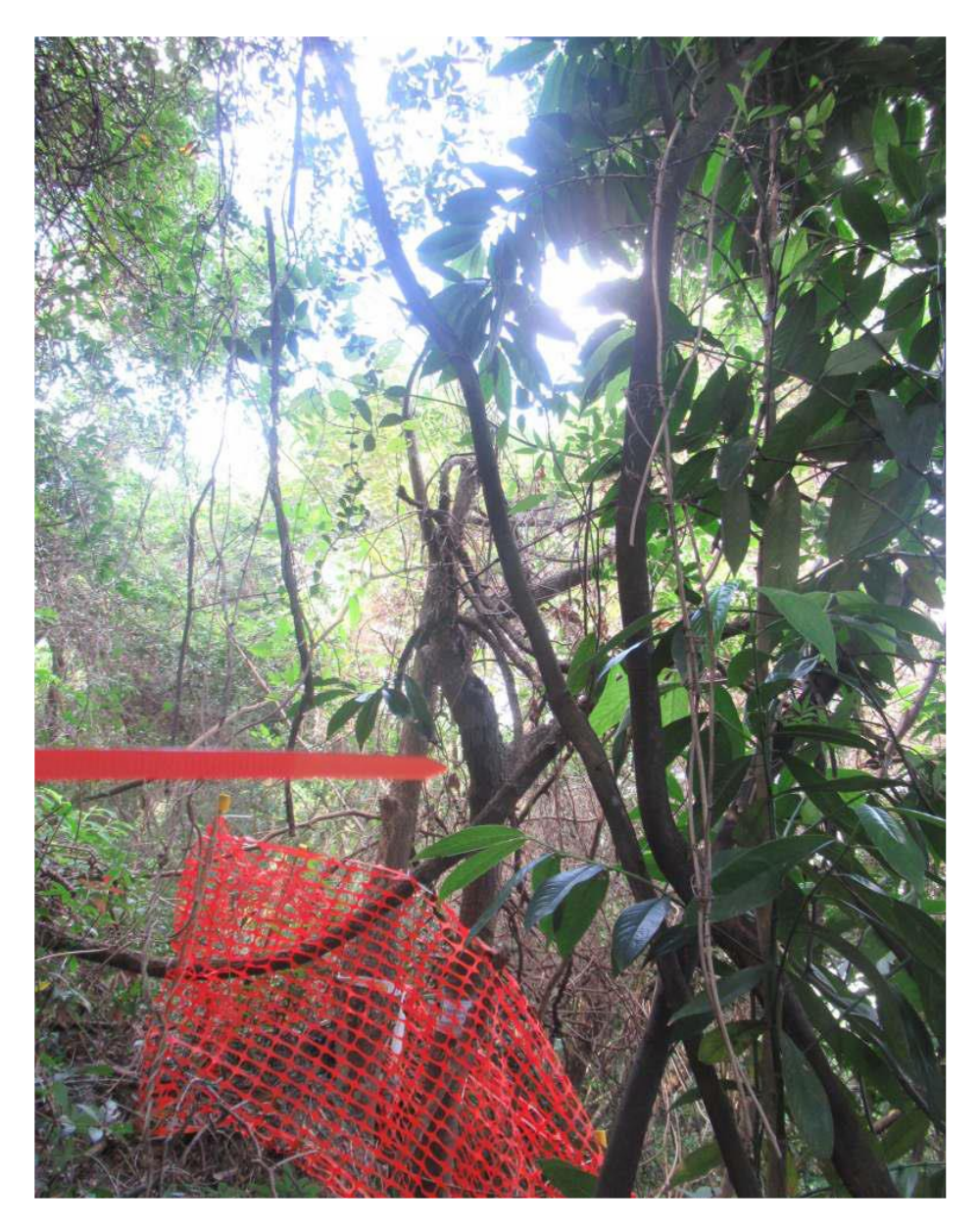
Photo 1 – Tree protection zone for preserved plant species of conservation importance